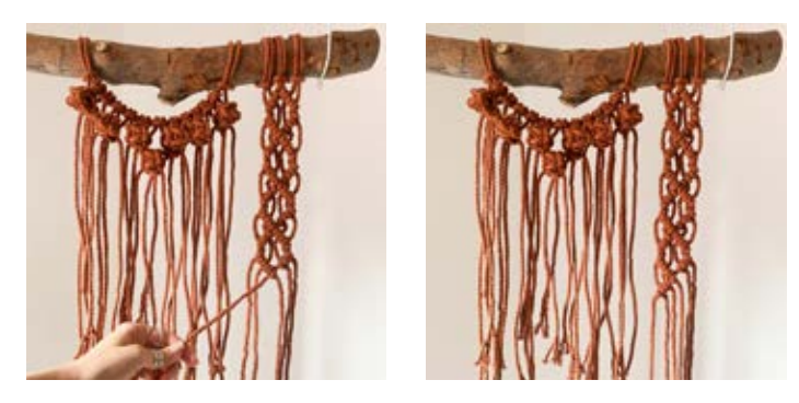
STEP 11: Do the same for the other side symmetrically (steps 6 to 10).

STEP 10: Grab the last lead cord and make one more doublé half-hitch knot diagonally. Then grab the 3rd rope on the left (our new lead cord) and work a doublé half-hitch knot diagonally on this lead cord with the 2 next left cords.