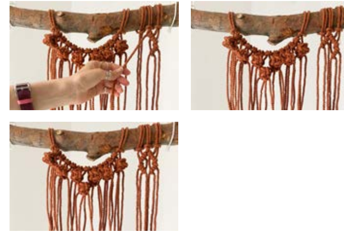
STEP 9: Repeat three times more the steps 7 and 8.

STEP 8: Grab the 3rd rope on the left, this will be now the lead cord. Work a doublé half-hitch knot diagonally on this lead cord with the 2 next left cords and then with 2 cords to the right.